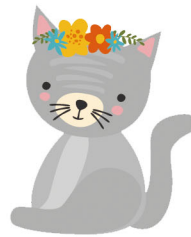
An old cat