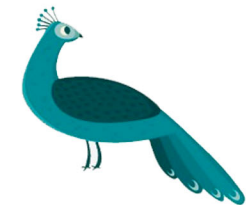
A peacock that cannot attract a mate