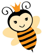
A queen bee