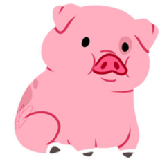
A stinky and obese pig