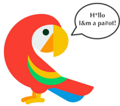
A parrot with an accent