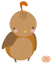
A hen that cannot lay egg